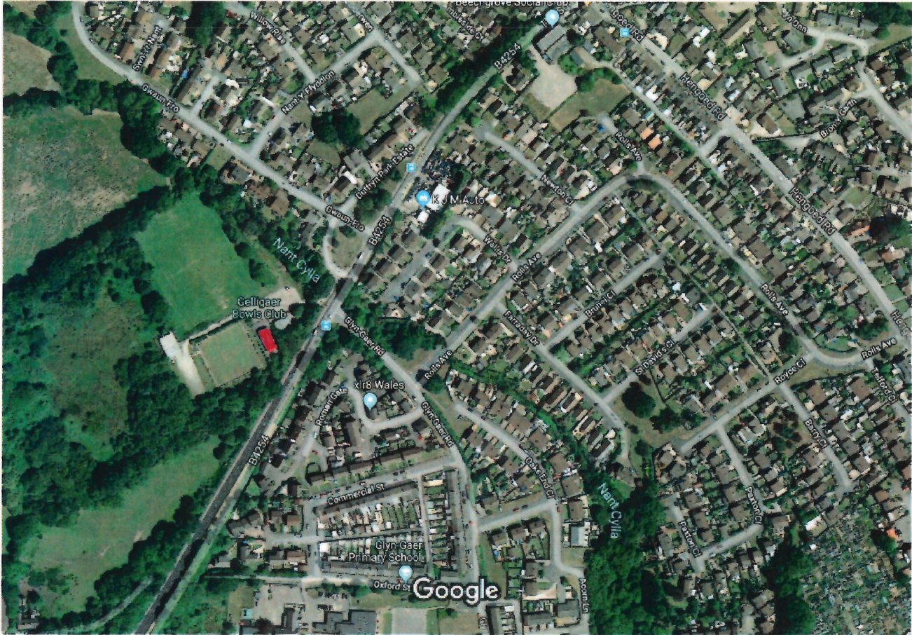
Imagery ©2019 Google, Map data ©2019 Google 50 m